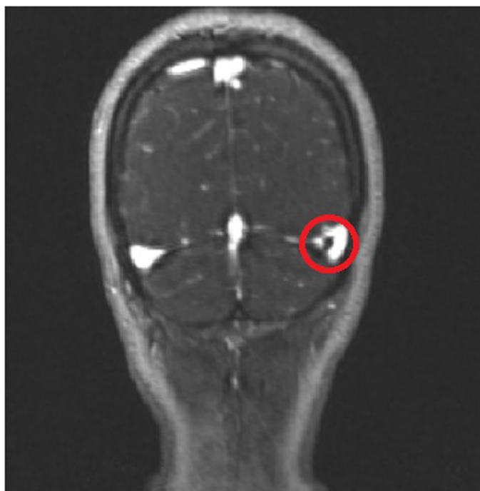
Figure 1. In the magnetic resonance venography image, a hypointense lesion (red circle) is seen in the left transverse sinus.

in the body, these lesions measure 0-30 HU on brain CT and appear isodense with cerebrospinal fluid. They are observed as intraluminal filling defects on contrast-enhanced examinations. Intradural venous sinus cysts appear isointense with cerebrospinal fluid in all sequences on MRI, that is, hypointense on T1-weighted and FLAIR images, and hyperintense on T2-weighted images (Table 1). 2