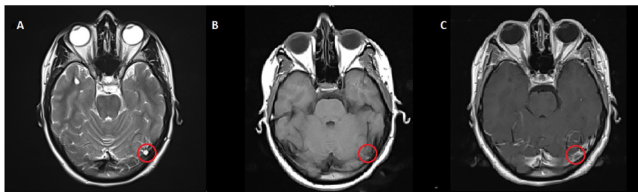
Figure 2. In the axial T2WI (A), a hyperintense lesion is seen in the left transverse sinus. The lesion shows no enhancement on pre- (B) and post-contrast (C) T1WIs. T1WI, T1-weighted image; T2WI, T2-weighted image.

Intradural venous sinus cysts are congenital and very rare pathologies. They are usually asymptomatic and detected incidentally. However,